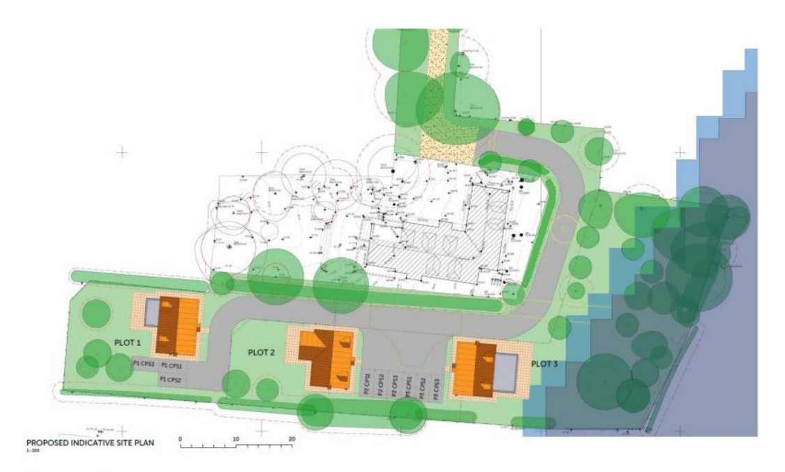
Figure 3 - Site plan overlain with flood zones

The applicant has demonstrated that the development can be achieved without development taking place in flood zones 2 or 3. However, as the application is in outline only, with layout a reserved matter, it is considered that it is both necessary and relevant to make it a condition of planning permission that no development may take place in zones 2-3.